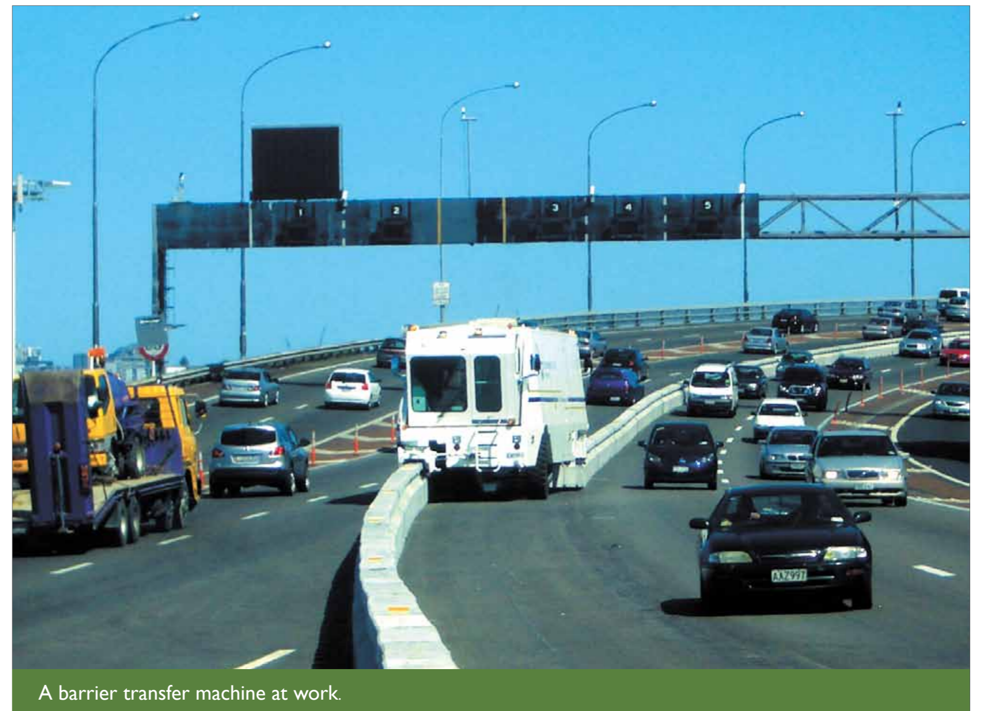
A barrier transfer machine at work.